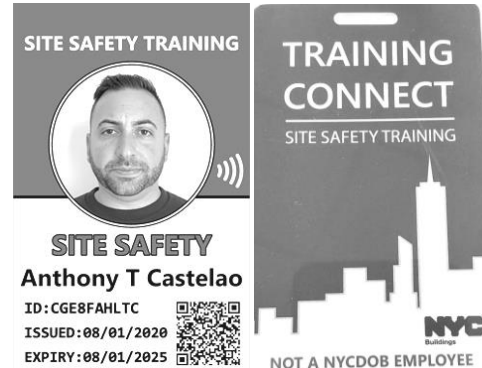
NEW STYLE CARD

After Tuesday, JANUARY 31, 2023 your old SST card will be invalid and will NOT be accepted on construction sites in New York City as per the Department of Buildings.